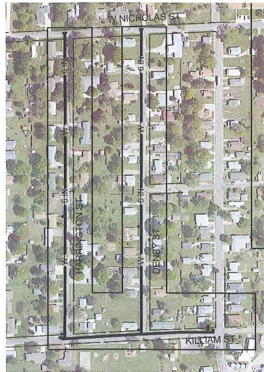
KILLIAM, HARRINGTON & DENBY STREET